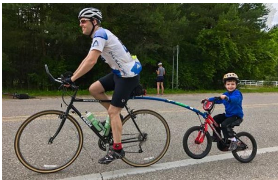
The Ride Around Torch brings out cyclists of every ability in a day of fun around Torch Lake in Antrim County.

we're lucky to have so many volunteers pitching in," she says. "Most bring a lot of experience from past tours, so it's a really fun, well-organized event."